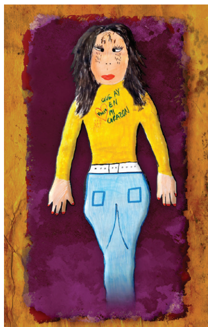
Body maps created by participants. From left: body map of woman living with HIV; body map of trans woman; body map of sex worker