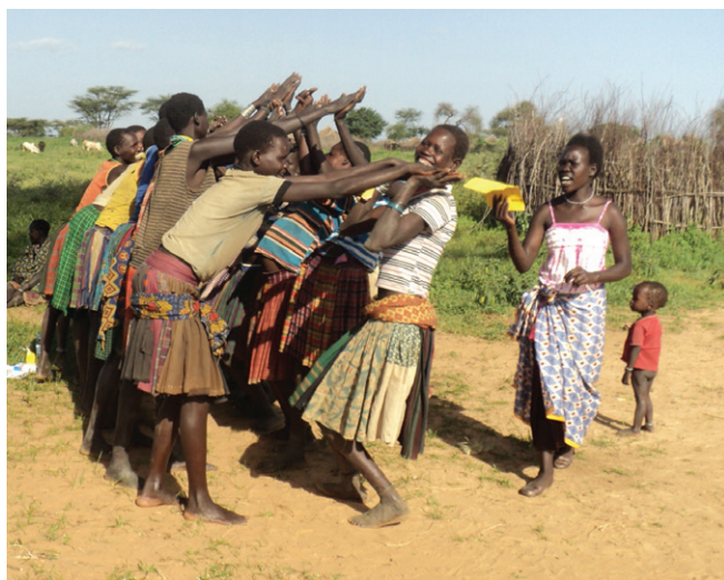
Participants in the Stepping Stones project, Karamoja, Uganda.

In order to build on the findings of the pilot, the authors of the evaluation recommended a longer-term operational research programme integrating livelihoods and gender norm interventions. They suggested this should be done by continuing to work with both men and women, and by pursuing an intergenerational approach over a broader geographic area. Future programmes also should feature focused work to support the socioeconomic issues facing the lonetia . Overall, however, the evaluation findings indicate that addressing gender norms through an adapted community-specific approach is an effective way to change beliefs around GBV.