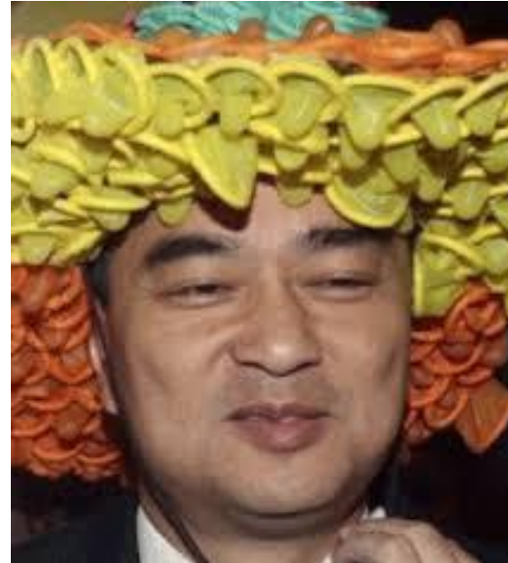
Former PM Apisit, 25 Nov 2010